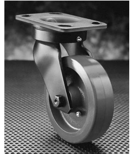
GT Series Swivel

A two-way directional wheel lock is available to convert the GT Series swivel caster to a fixed caster by the release of a spring-loaded plunger. The locked direction of travel is in line with the longer side of the top plate. To order a directional lock, add suffix L to the Swivel Part #.