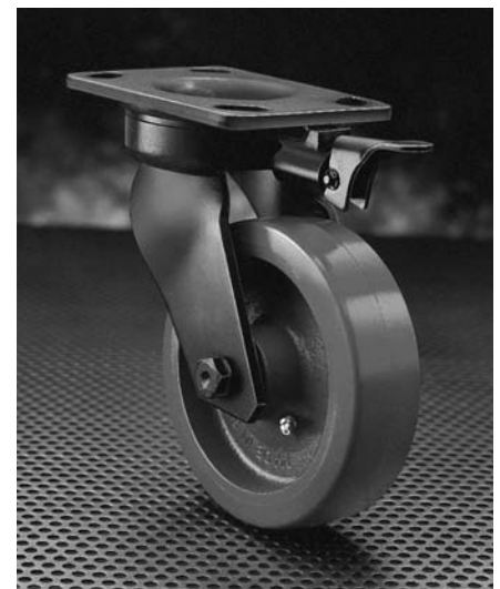
GT Series 2-Way Directional Lock