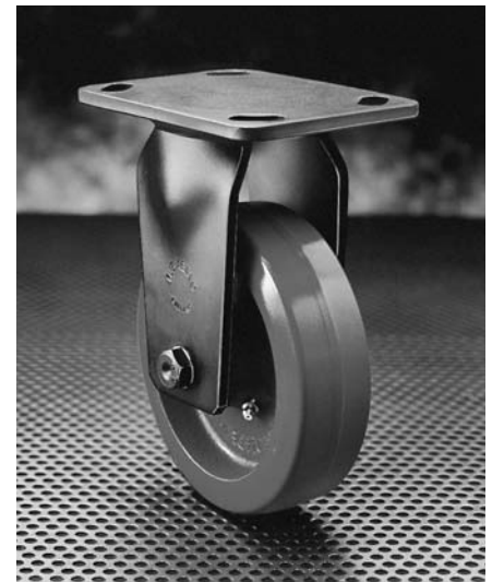
GTF Series Fixed