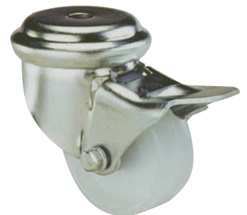
Bolt hole swivel style shown with nylon wheel and foot brake

* Threadguards only available for 1-5/8" & 2" models with Nylon wheels and 2" & 2-1/2" casters with Revvolute wheels