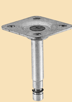
Square top plate and pin

To order a 5" TravelAid with gray rubber wheels and gray nylon center with a square plate, the order codes are as follows: 1232040, 1234010, 1288888.