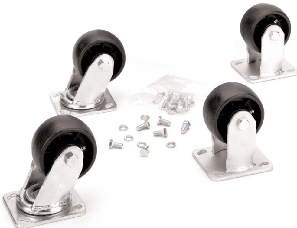
Complete kit includes two swivel and two rigid casters with polypropylene wheels in 4", 5" or 6" diameters, plus 16 attaching bolts and lock washers.